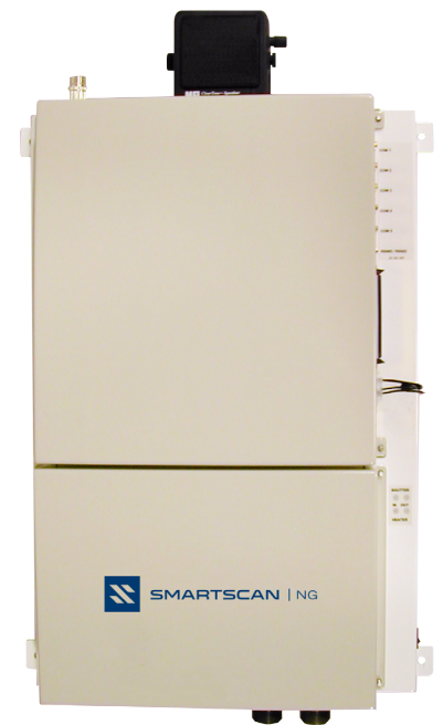
2300 Chassis & Controller

The Model 2300 system is modular by design, allowing the system to be configured as needed for specific environments. The basic system is delivered as a Hot Bearing detector. Additional capabilities can be added by simply attaching input devices like wheel scanners, dragging equipment detectors, high/wide load detectors, and the MPRR-RFID module. The system software of the Model 2300 already contains support for each of these options. Simply adding the hardware required for the desired function and activating it in the software enables these capabilities.