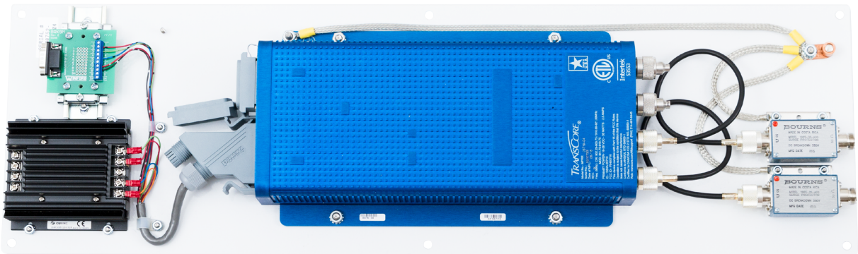
MPRR - AEI Reader

announcements delivered on the radio will include the car number with the defect. The Model 2300 system maintains records for the last 100 trains that it has scanned. The records can be delivered over a network IP connection or copied to a local PC through a serial connection. Records can be viewed in a standard ASCII text format or in S-918B format.